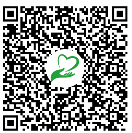
Scan and Donate