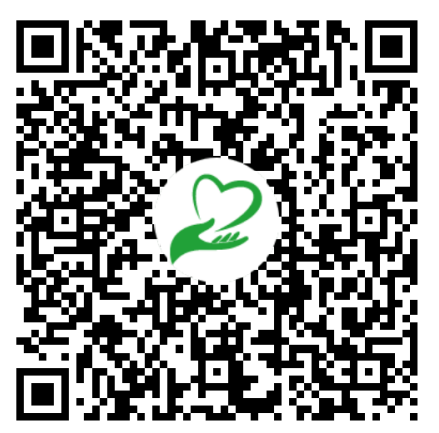
Scan and Donate